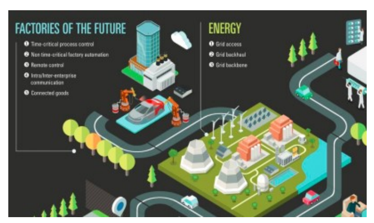
Figure 1. 5G driving industrial and societal changes8